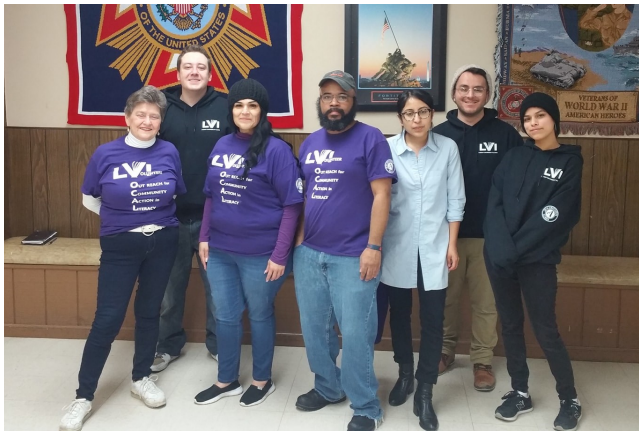
LVI AmeriCorps members serving at the VFW Rhine Hall