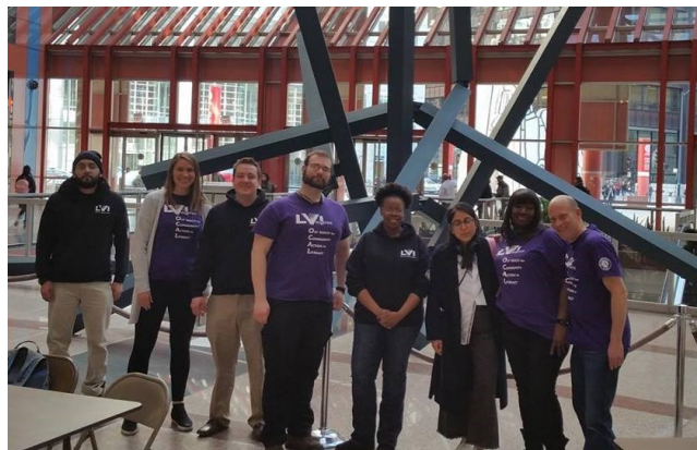
LVI AmeriCorps members serving at the Thompson