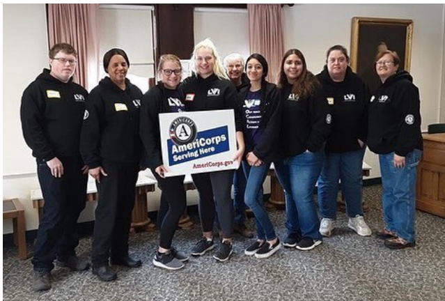
LVI AmeriCorps members serving at the VFW Rhine Hall